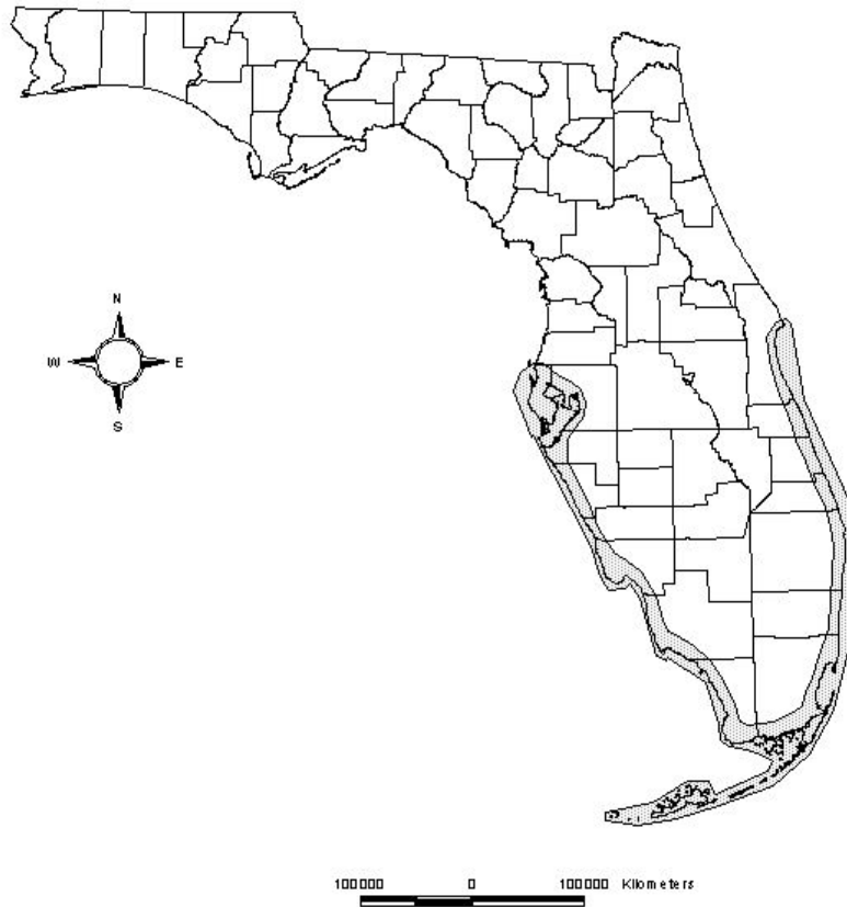
Figure 1. Historic range of the Miami blue butterfly.